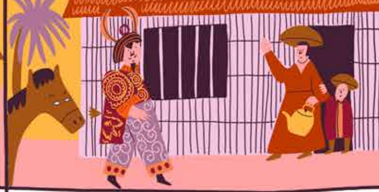
Instead, the shogun walked into the best house in the village hoping for a miracle.