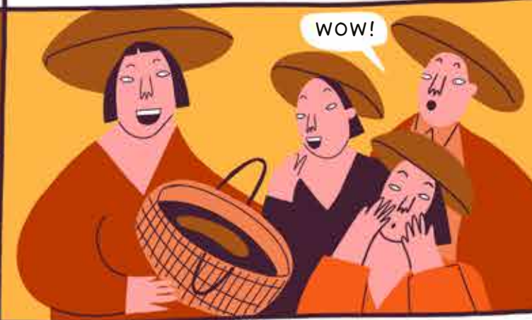
Everyone in the village honoured the poo forever after!