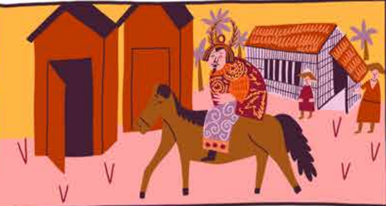
He rushed to a nearby village, but those lowly peasants only had privies!