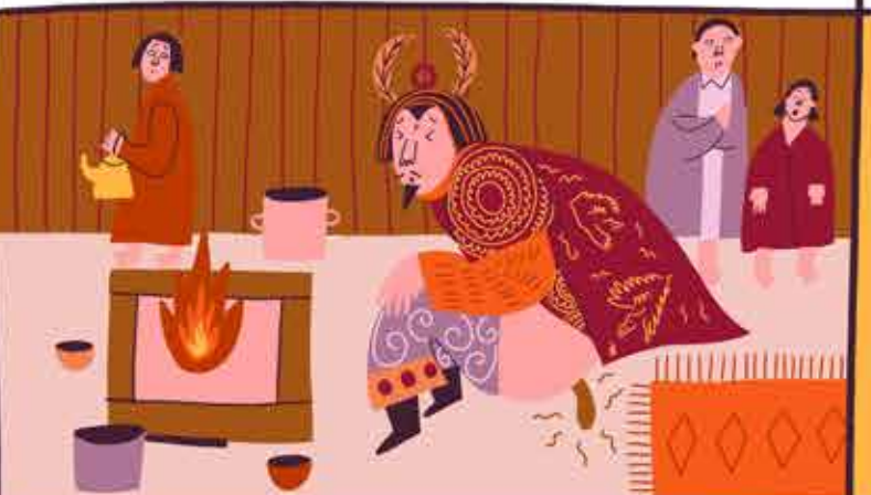
He pulled down his trousers and pooed right in the middle of the floor, then left!