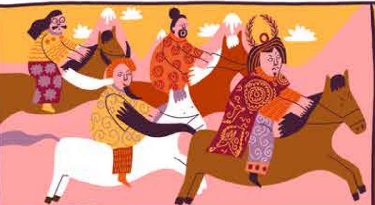
Two hundred years ago, a powerful shogun was hunting with his friends in a forest.

This folk story was told to show how much people used to honour shoguns - Japanese warrior kings. Do you think it's true?