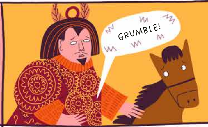
"It's that special time, everyone!" he said. But his friends had forgotten his close stool.