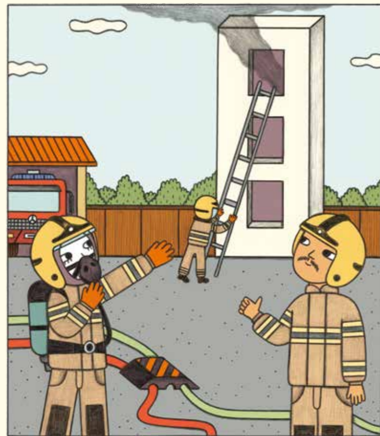
When training in the drill yard, we pitch ladders against tall towers and use breathing equipment to practise entering smoke-filled buildings.