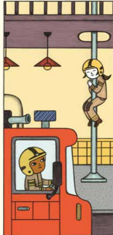
When an emergency call comes in, we drop what we're doing and race to the scene to put all our training into action!