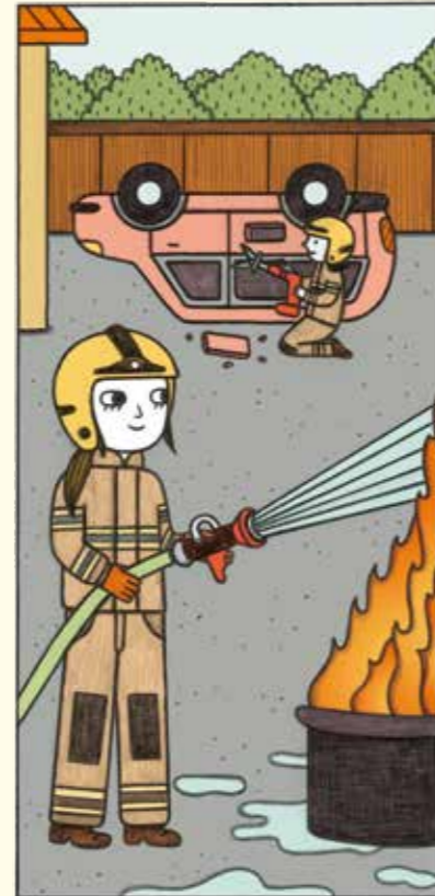
We practise using high-pressure hoses to put out roaring flames, and use a hydraulic spreader-cutter to train for rescuing people trapped in cars.