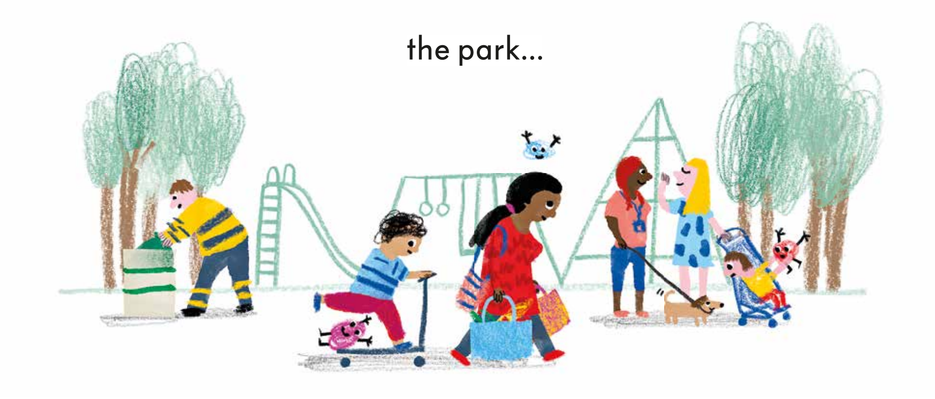
and home again for tea.